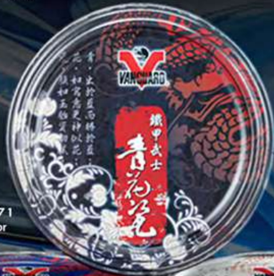
RH-5071 DARK Color