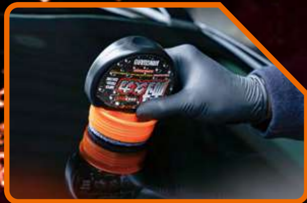
EASY TO USE AND OPERATE