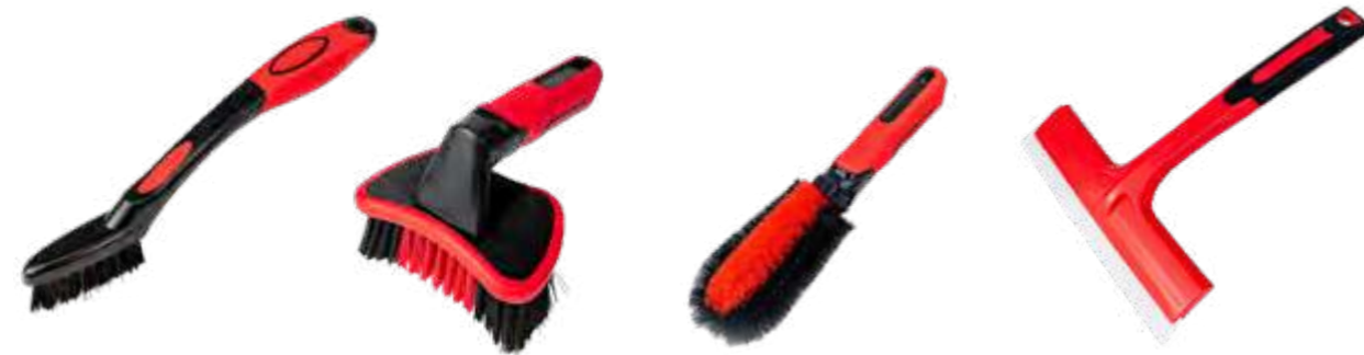
Detail Cleaner Brush