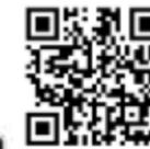
▲ Video Link