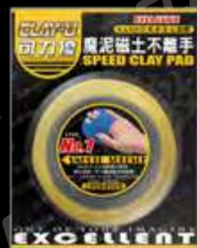
CLAY PALM TYPE