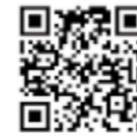
▲ Video Link

Thin & Light / Water absorption / Quick drying