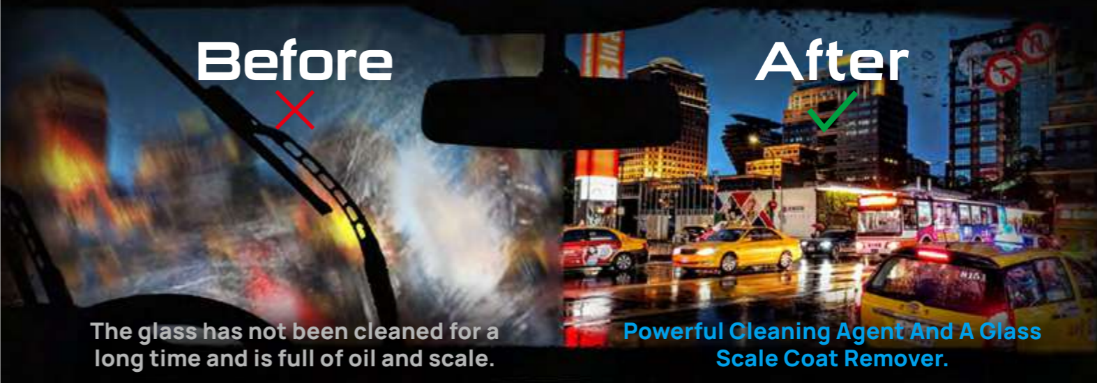
The glass has not been cleaned for a long time and is full of oil and scale.