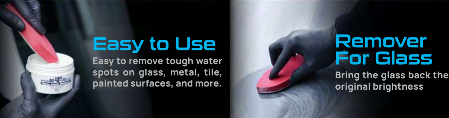
Powerful Cleaning Agent And A Glass Scale Coat Remover.