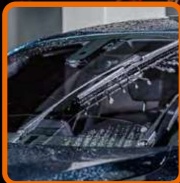
EXTENDS LIFE OF WINDSHIELD WIPERS