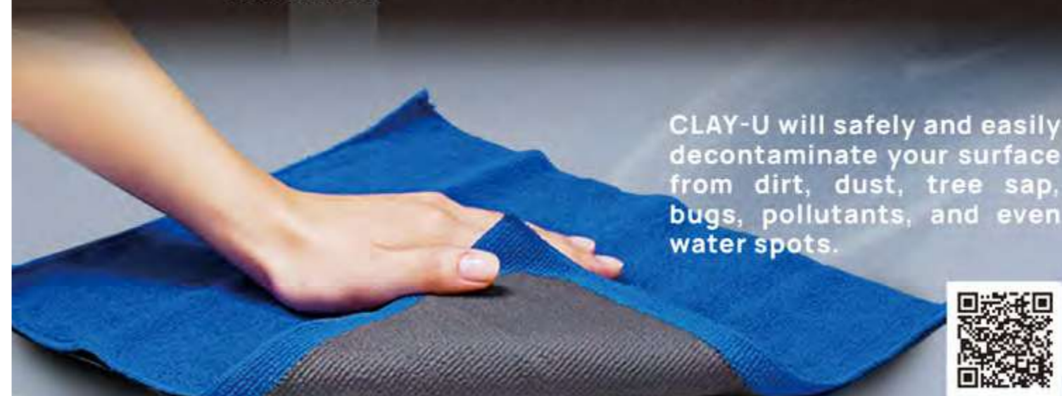
B6305 CLAY AIR CLOTH

CLAY-U will safely and easily decontaminate your surface from dirt, dust, tree sap, bugs, pollutants, and even water spots.