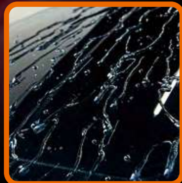
WATER INSTANTLY BEADS UP