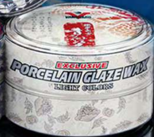
RH-5072 LIGHT Color

EXTREME ABRASION RESISTANCE, UV- AND SOLVENT RESISTANCE