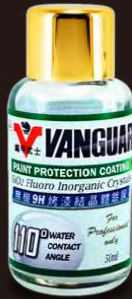
RH-5064 PAINT PROTECTION COATING