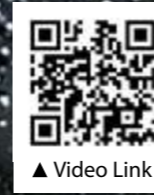
▲ Video Link