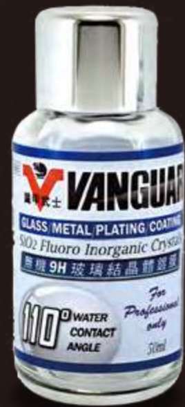
RH-5066 GLASS/METAL PLATING COATING

High Hardness / High Brightness / High inorganic silicon