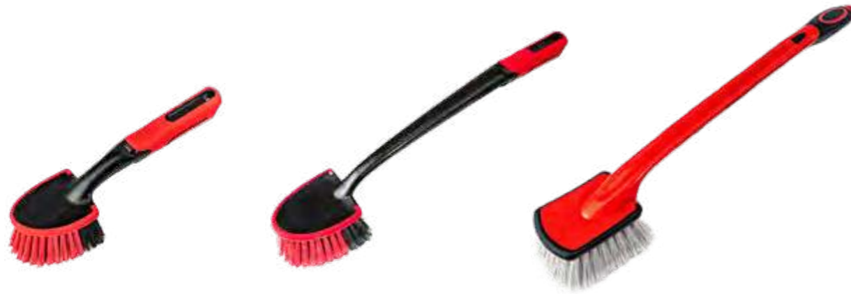
Scrub Cleaner Brush

The VW Brushes series are the perfect tool set for all exterior and interior cleaning tasks.