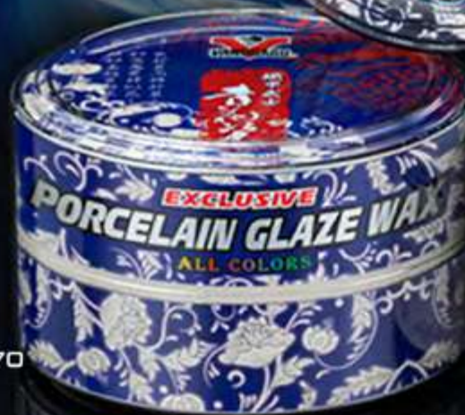
RH-5070 ALL Color