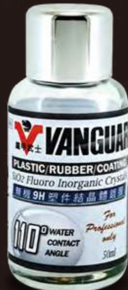
RH-5065 PLASTIC/RUBBER COATING