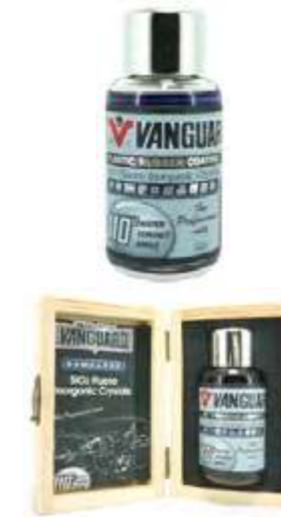
▲ Plastic parts