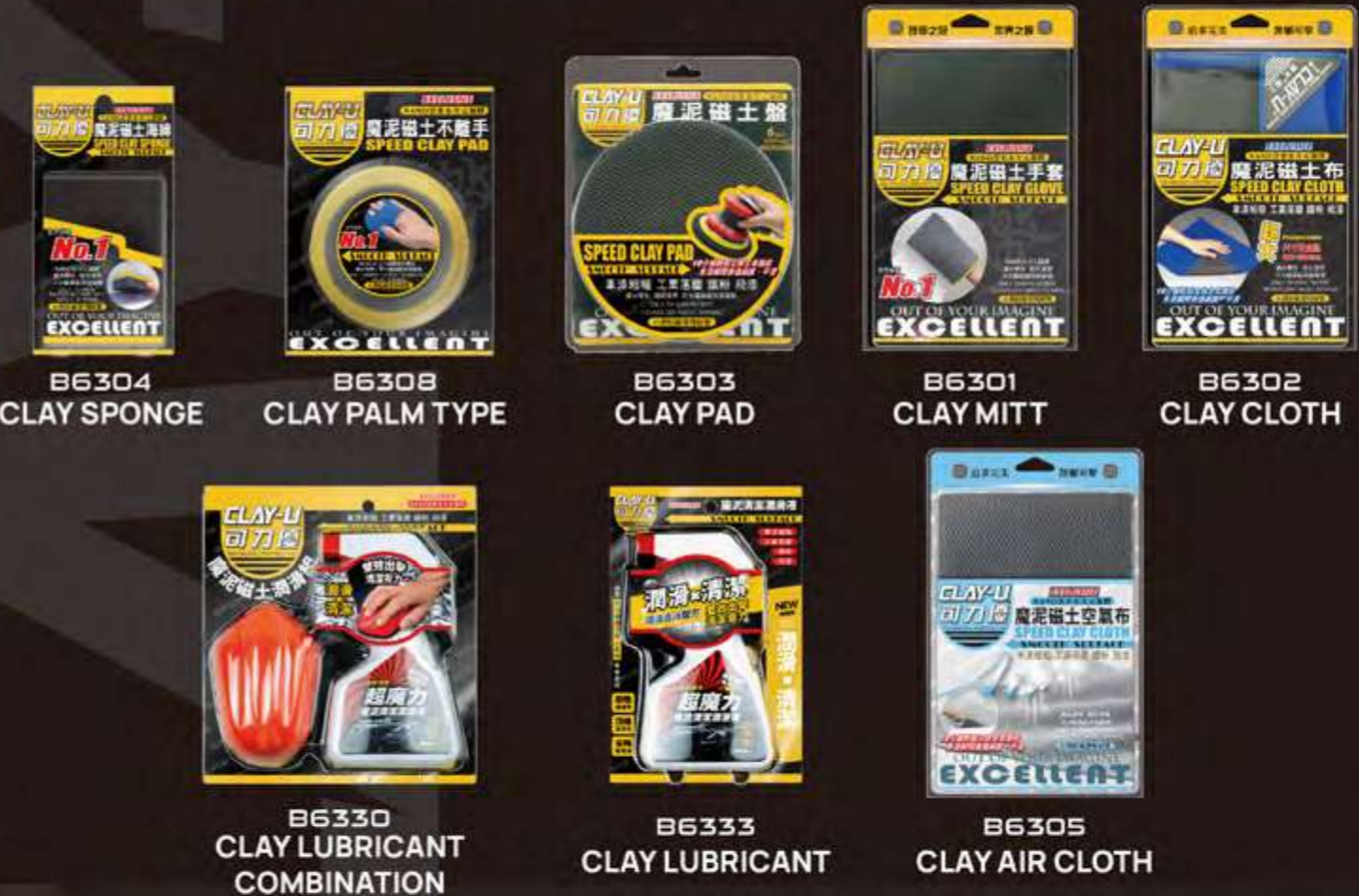
B6304 CLAY SPONGE