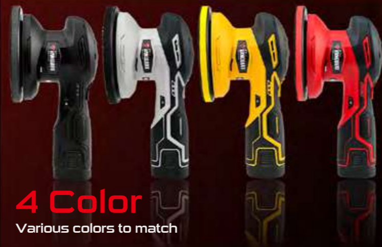
4 Color Various colors to match