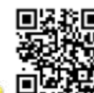
▲ Video Link