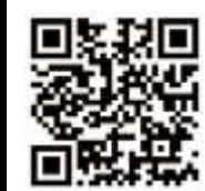
▲ Video Link