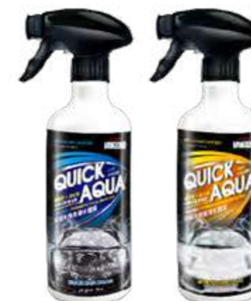
▲ Dark Car ▲ Light Car